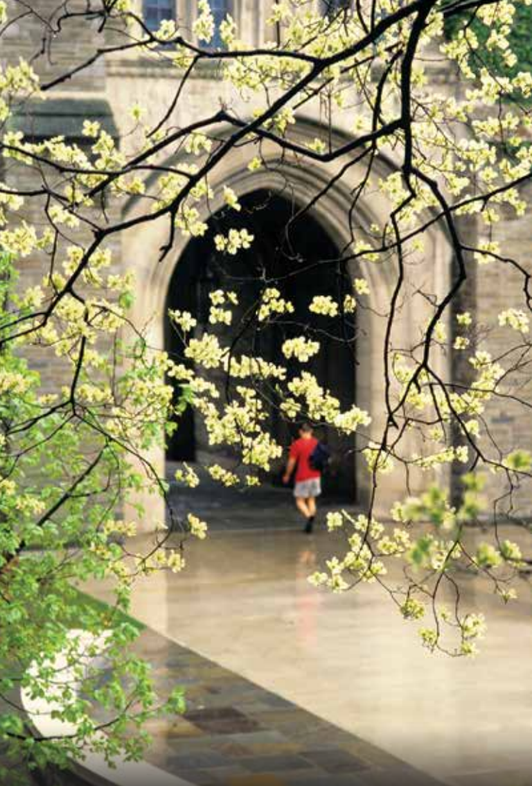
A Myron Taylor Hall archway in spring.